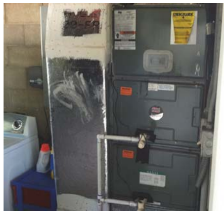
Heat/AC Air Handler