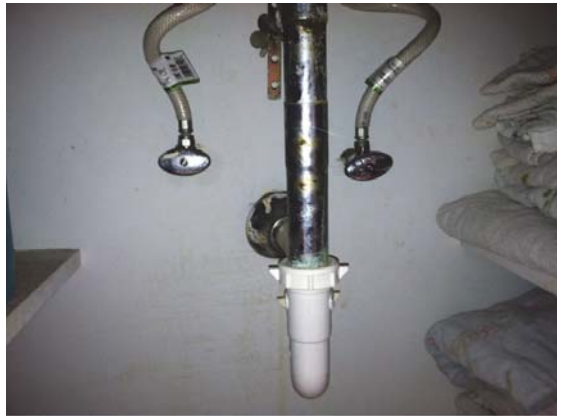
Under Master Bath Sink