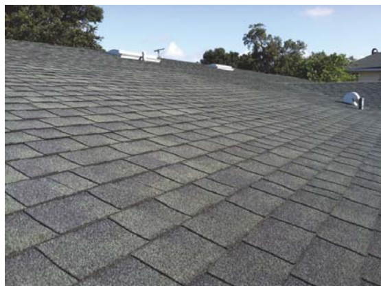
ROOF PHOTO 1