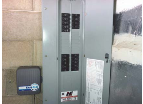
MAIN ELECTRIC PANEL