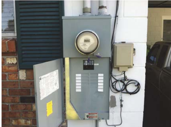
ELECTRIC SERVICE INTO HOUSE