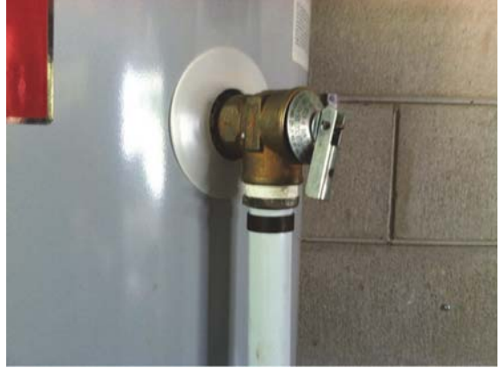
WATER HEATER TPR VALVE