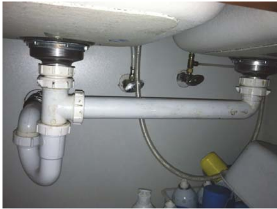
Under Kitchen Sink