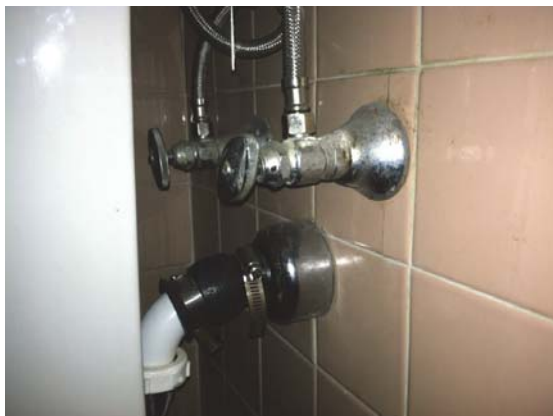
Under Sink Bathroom 1