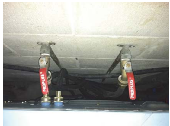
WASHING MACHINE HOOK UP