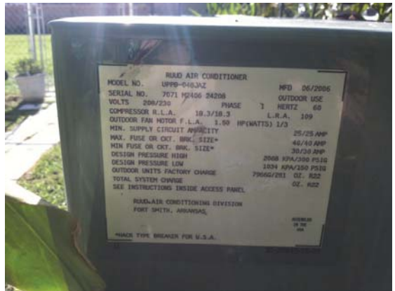
Heat/AC Manufacturer's Label - Compressor