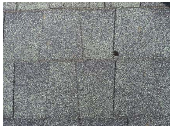
ROOF PHOTO 2