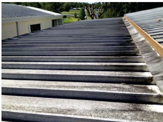
Secondary (carport/utility room)