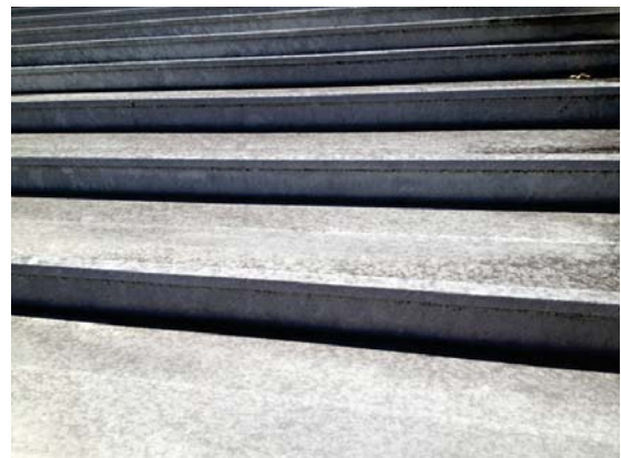
Secondary (carport/utility room)

ADDRESS INSPECTED: 39 Bahia Way Leesburg, FL 34788