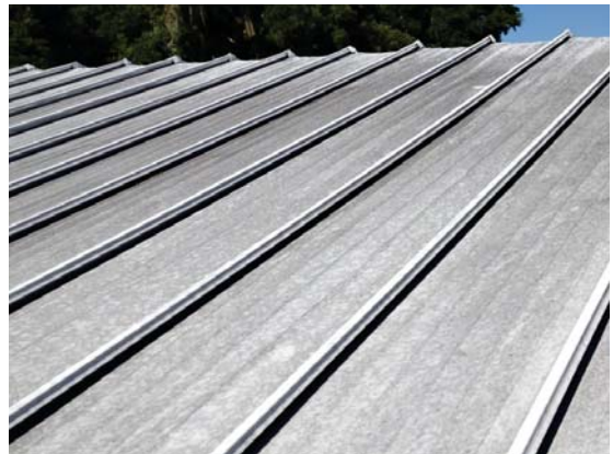
ROOF PHOTO 2