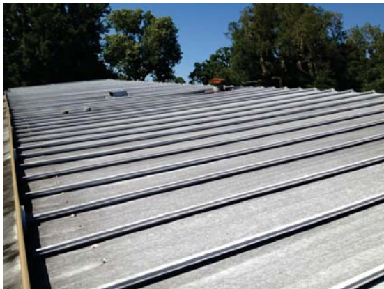
ROOF PHOTO 1